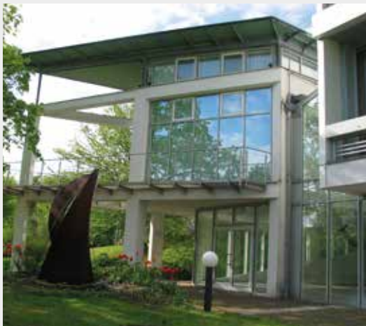
Former b-it building, overlooking the Rhine.