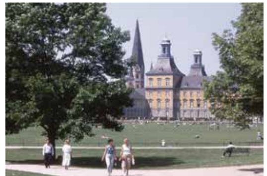
The spacious Hofgartenwiese is a major summer attraction on the University of Bonn campus.

RWTH Aachen University was founded as a Polytechnic in 1870 with considerable support from local industry. In 1948 it was established as Rheinisch-Westfälische Technische Hochschule Aachen (RWTH), the Institute of Technology of the State of North Rhine-Westphalia. Today, RWTH is one of the most renowned technical universities in Europe with around 47,200 students. RWTH offers 170 courses of study (undergraduate and postgraduate). The RWTH master programs educate engineers who are keen to engage in R & D, innovation, and entrepreneurship. Since 2007, RWTH Aachen was elected and re-elected three times as one of the “elite universities” within the German excellence program. In the current Times Higher Education Ranking, RWTH Aachen University is placed 147th among the several thousand evaluated universities.