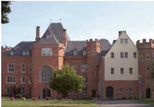
Entrance of Birlinghoven Castle.

The Birlinghoven Castle campus is one of the largest and most influential computer science research sites in Germany. About 600 researchers work in the IZB institutes. That represents a quarter of the Fraunhofer ICT Group, Europe's largest IT research organization. The institutes collaborate closely with the European ERCIM network of national IT research centers as well as with leading research establishments in the USA, Eastern Europe and Asia. Three IZB institutes contribute to the b-it master programs Media Informatics and Life Science Informatics: