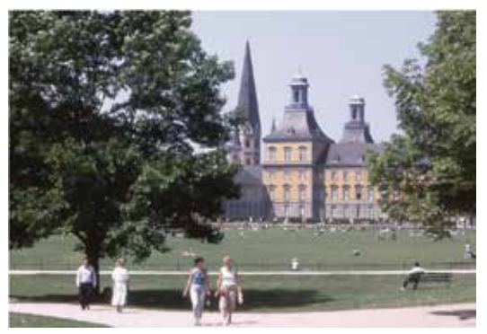
The spacious Hofgartenwiese is a major summer attraction on the University of Bonn campus.

RWTH Aachen University was founded as a Polytechnic in 1870 with considerable support from local industry. In 1948 it was established as Rheinisch-Westfälische Technische Hochschule Aachen (RWTH), the Institute of Technology of the State of North Rhine-Westphalia. Today, RWTH is one of the most renowned technical universities in Europe with around 45,400 students. RWTH offers 157 courses of study (undergraduate and postgraduate). The RWTH master programs educate engineers who are keen to engage in R & D, innovation, and entrepreneurship. In 2007, RWTH Aachen was elected as one of nine "elite universities" within the German excellence program. In the current Times Higher Education Ranking, RWTH Aachen University is placed 87th among the several thousand evaluated universities.