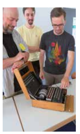
The Enigma machine.