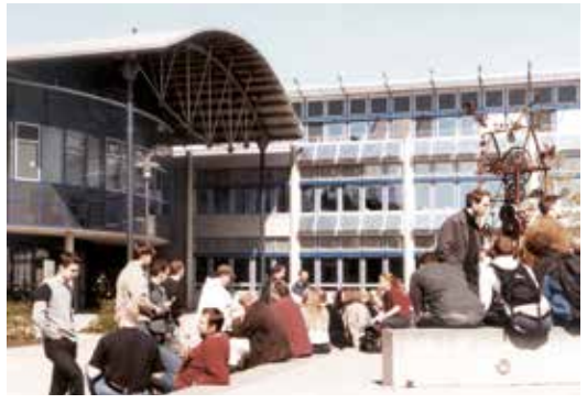
Campus of the Bonn-Rhine-Sieg University of Applied Sciences.

The Department of Computer Science offers a Bachelor and a Master program in Computer Science and in cooperation with the Departments of Business Administration a Bachelor program in Business Information Systems. The Master program Autonomous Systems is offered by the b-it Applied Science Institute, a cooperation between the Department of Computer Science and the Fraunhofer Institute for Intelligent Analysis and Information Systems IAIS.