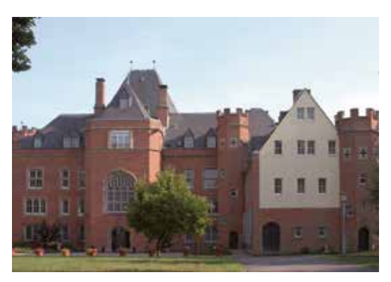
Entrance of Birlinghoven Castle.

The Birlinghoven Castle campus is one of the largest and most influential computer science research sites in Germany. About 500 researchers work in the IZB institutes. That represents a quarter of the Fraunhofer ICT Group, Europe's largest IT research organization. The institutes collaborate closely with the European ERCIM network of national IT research centers as well as with leading research establishments in the USA, Eastern Europe and Asia. Three IZB institutes contribute to the b-it master programs Media Informatics and Life Science Informatics: