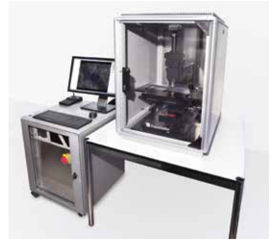
TopoScan microscope of Fraunhofer FIT: TopoScan is a modular hardware-software platform for the automated high content analysis of biological samples. Its unique software-driven architecture combines two properties within one system: Streamlined workflows with minimal intervention for the reproducible acquisition and analysis of high content assays.

FIT, the Fraunhofer Institute of Applied Information Technology, investigates human-centered computing in a business or engineering process context. The usability and usefulness of information and cooperation systems is optimized in their interplay between human work practice, organization and process. In Life Science Informatics the institute focuses on protein analysis, visual support for navigation in micro surgery, and assistive information technology. In Media Informatics innovative information visualization systems, mixed and augmented reality environments for industrial planning, pervasive gaming applications, and value chains for public-sector information services are main research topics.