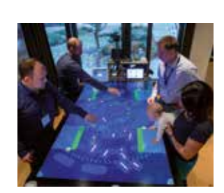
TABULA touch table display.

The TABULA research project at Prof. Jan Borchers' b-it Endowed Chair for Media Informatics and Human Computer Interaction has been selected as one of four flagship projects in the Tangible Learning Initiative of the German Ministry of Science and Education (BMBF). TABULA uses an original invention of the chair's – graspable, physical "tangibles" that are tracked by a large, modern capacitive touch table display – to help student teams learn fundamental computer science concepts more easily together. The BMBF has organized a roadshow that travels to four university locations in Germany with TABULA and three other core research demonstrators.